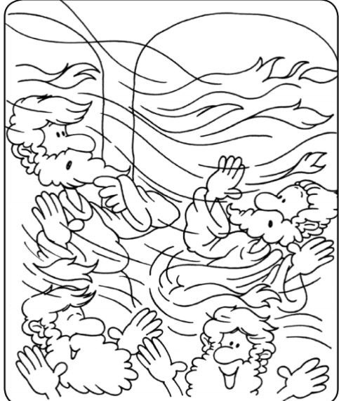
Divided tongues as of fire appeared to them and rested on each one of them. And they were all filled with the Holy Spirit. Acts 2:3-4